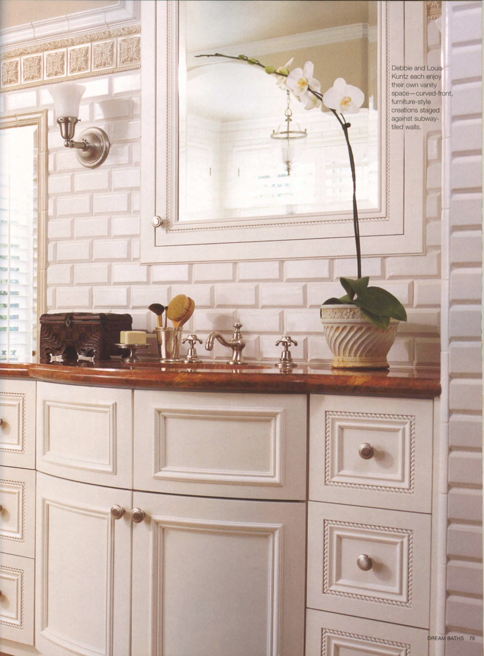
Debbie and Louis Kuntz each enjoy their own vanity space—curved-front, furniture-style creations staged against subway-tiled walls.